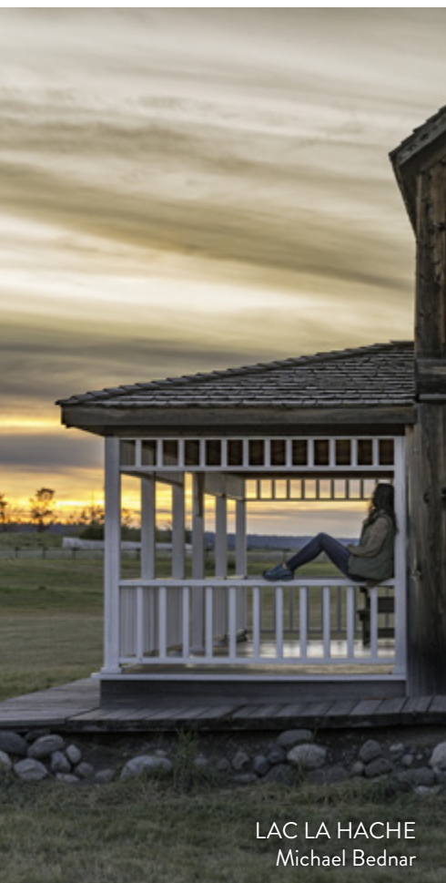
LAC LA HACHE Michael Bednar

It is possible to send the online survey to all stakeholders (a census) or a sample (or portion) of stakeholders. For most designated recipients, it is recommended that the survey is sent to all stakeholders. 6 The inclusion of all stakeholders ensures everyone impacted by the designated recipient's decision making has an opportunity to provide feedback and satisfaction scores which increases the accountability and transparency of the use of MRDT funds.