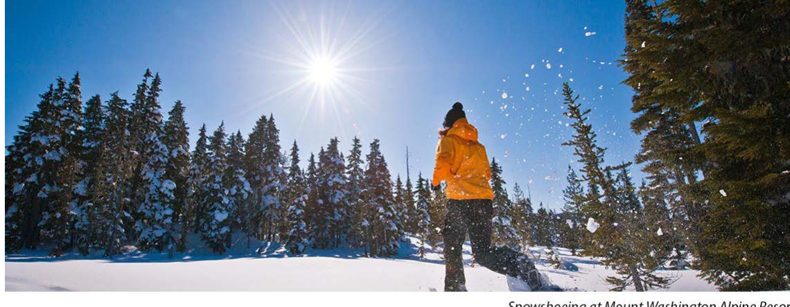
Snowshoeing at Mount Washington Alpine Resort