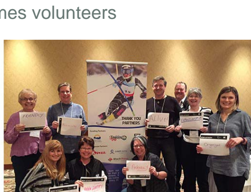
Penticon hosts at a WorldHost training session hold up signs with words exemplifying customer service strengths.

Our WorldHost training team is proud to contribute to the success of the upcoming BC Winter Games in Penticon by leading eight local sessions for volunteers. The customer service training will empower area volunteers to provide a warm welcome to visitors during the Games, to be held February 25 to 28. The training is part of an ongoing partnership with the BC Games Society. Learn more about WorldHost training here .