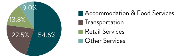
2014 tourism employment by sector

In 2014, 127,500 people were employed in tourism-related businesses, a 2.2% increase over 2013 and a 18.4% increase since 2004.