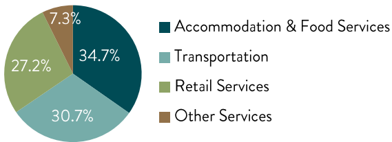
2014 tourism revenue by sector

Tourism revenue measures the money received by businesses, individuals, and governments due to tourism activities. In 2014, the tourism industry generated $14.6 billion in revenue, a 5.1% increase over 2013, and a 37.7% increase from 2004.