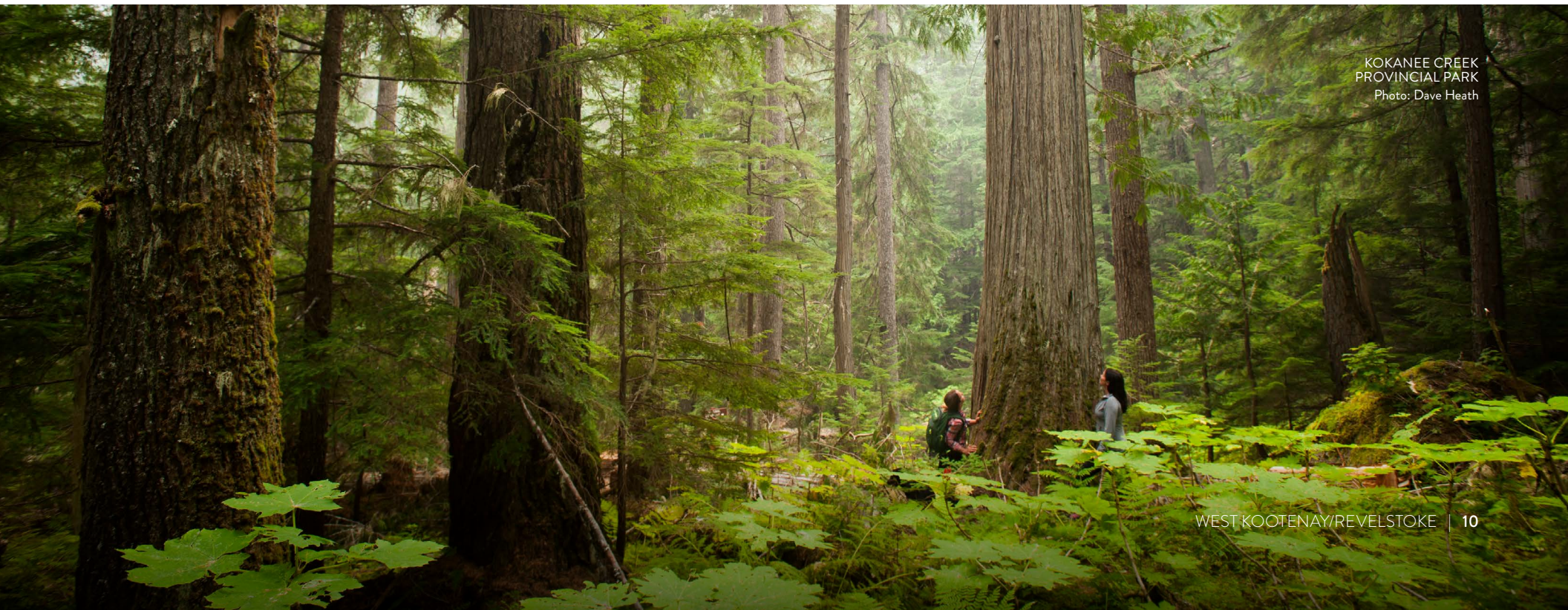
KOKANEE CREEK PROVINCIAL PARK

FRONT COVER PHOTO: IDAHO PEAK LOOKOUT