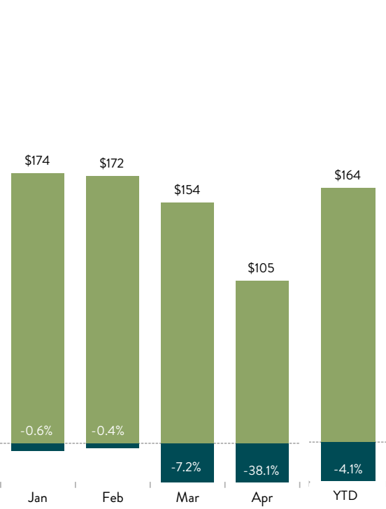
Provincial Average Daily Room Rate