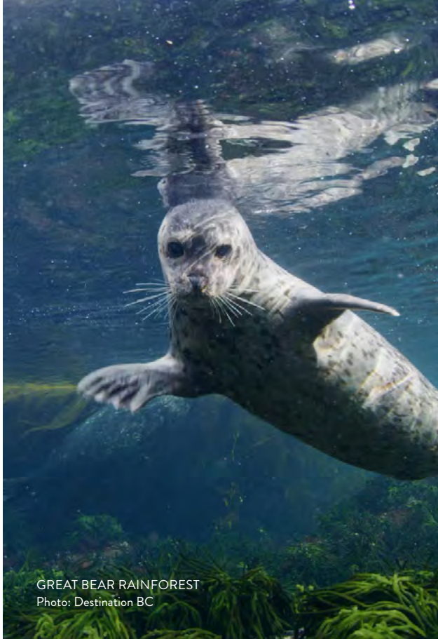
GREAT BEAR RAINFOREST