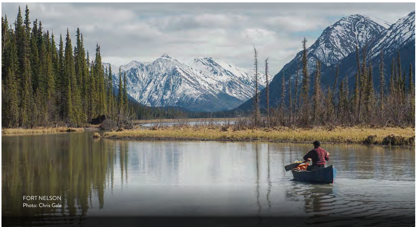
FORT NELSON

Destination BC strongly encourages Co-op Program applicants to review Destination BC's Global Marketing Strategy. To request a copy of the latest Global Marketing Strategy, email marketing.plan@destinationbc.ca .