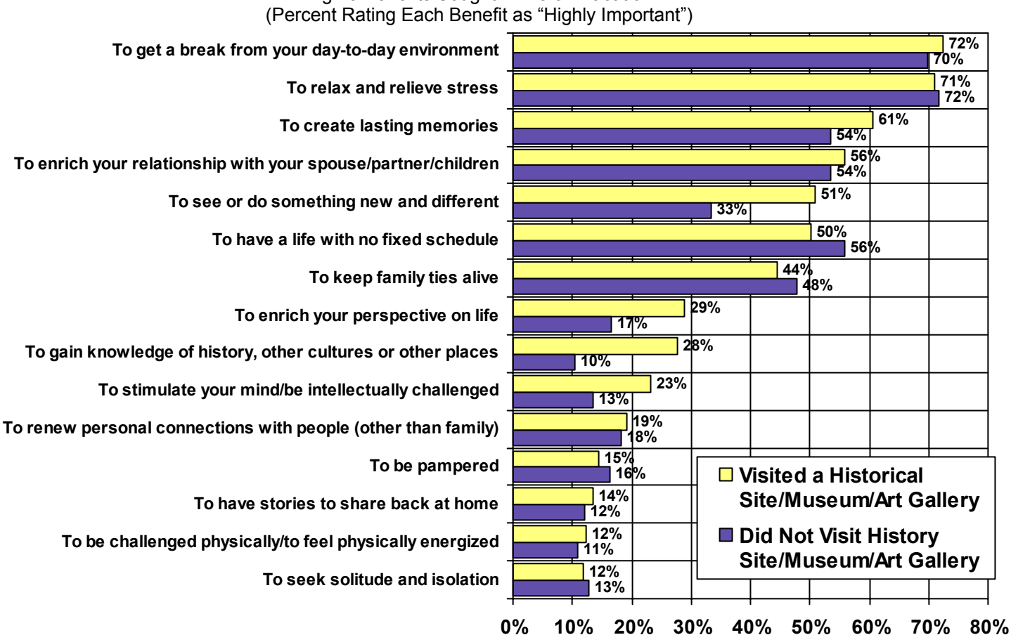
Fig.13 Benefits Sought While on Vacation

Similar to most U.S. Pleasure Travelers, those who visited Historical Sites, Museums and Art Galleries while on trips tend to take vacations to get a break from their day-today environment, relax and relieve stress, create lasting memories, enrich family relationships, see or do something new and different, and live without a fixed schedule. However, this activity segment is much more likely than the average U.S. Pleasure Traveler to seek novelty, intellectual stimulation and learning opportunities while on vacation (e.g., enrich your perspective on life, gain knowledge of history and other cultures or places, stimulate your mind).